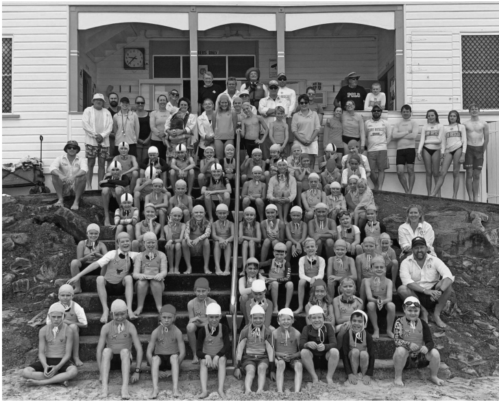
Yamba Nippers Group - 2020/21