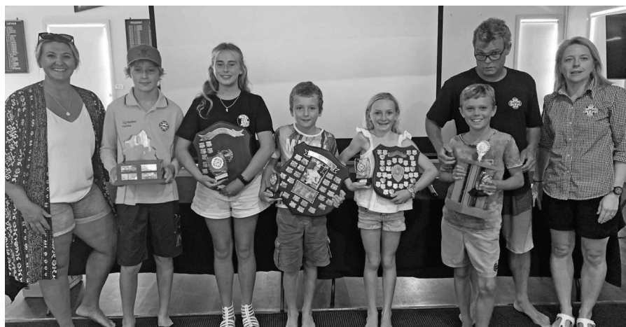
Nippers - Major Award Winners – 2020/21