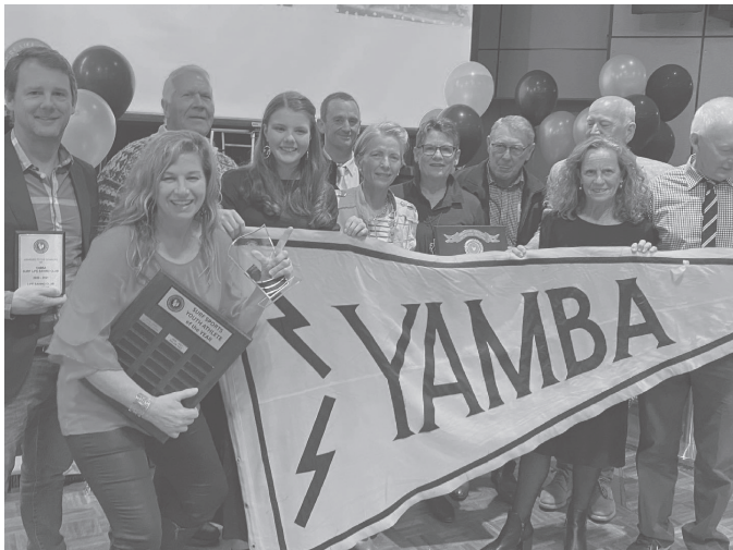
Club Representatives at the FNC Awards of Excellence Yamba SLSC – Life Saving Club of the Year