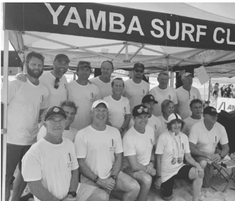
Yamba Masters competitors - Australian Titles