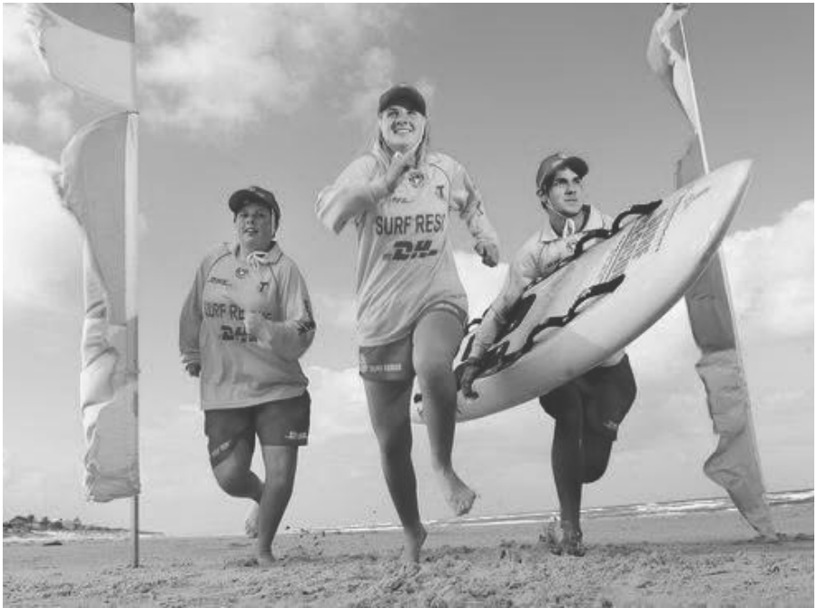
VIGILANCE AND SERVICE