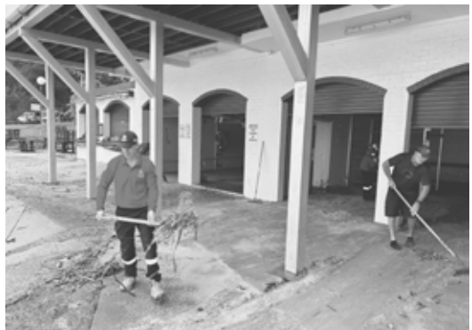
Clubhouse cleanup following Cyclone Alfred - with SLSNSW support