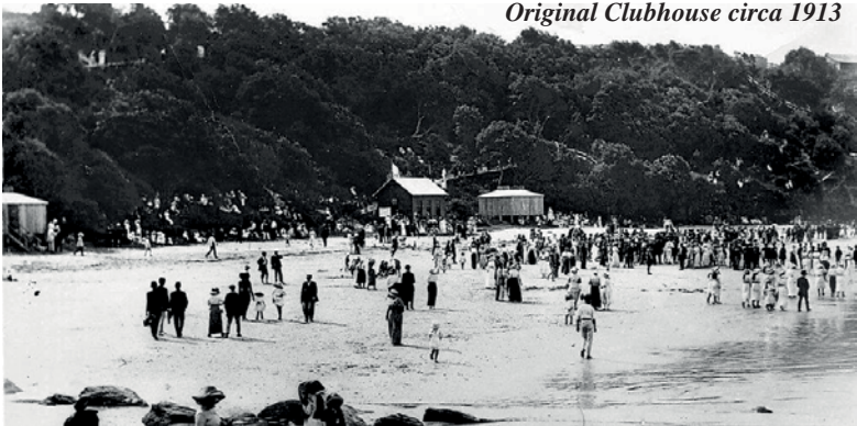
Original Clubhouse circa 1913