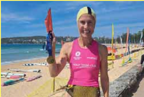
Dual Gold - Jeunesse Meldrum