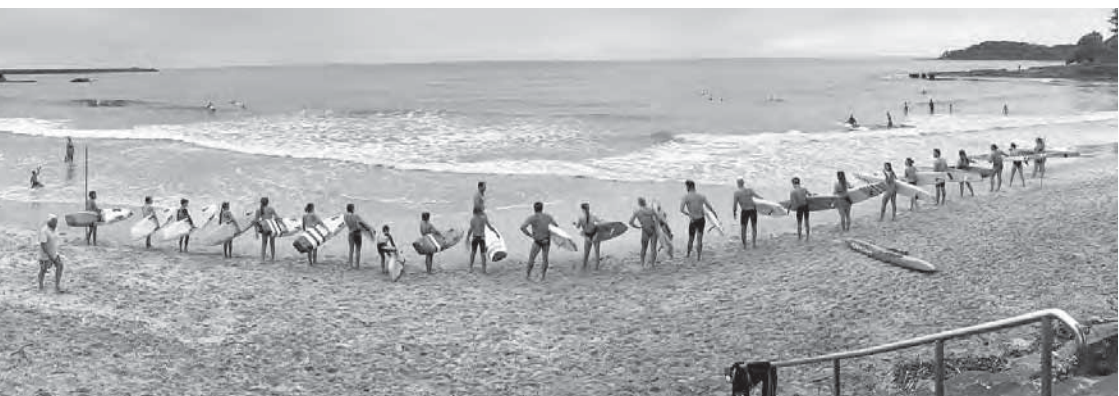
Board Training – Main Beach