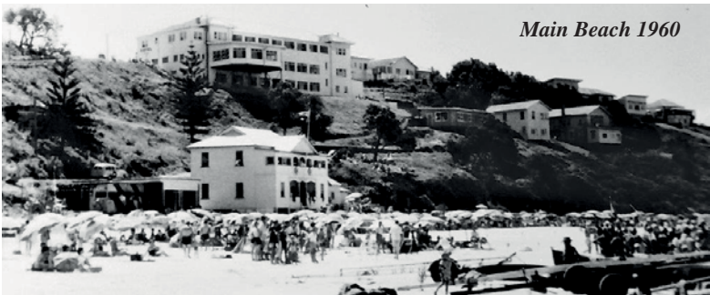
Main Beach 1960