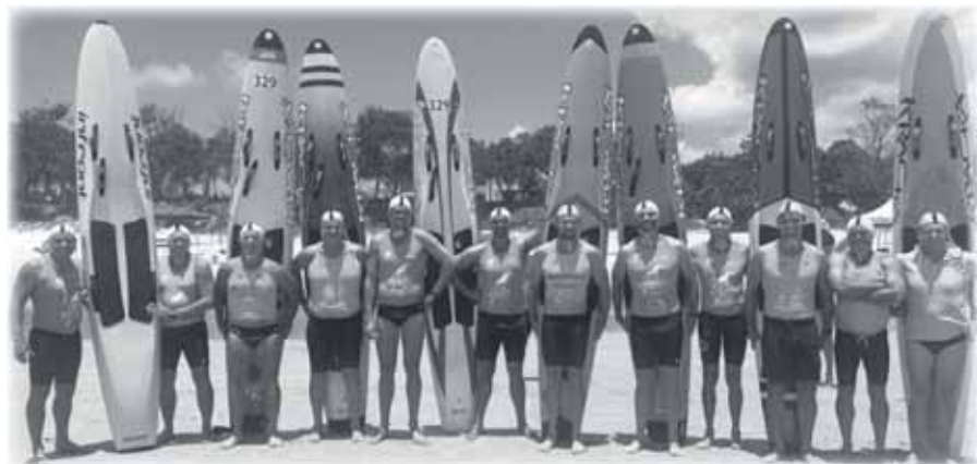
Yamba Masters Male Competitors Masters Carnival – Yamba – Feb. 2024