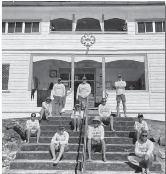
Patrolling through Covid at Yamba SLSC 2021/22