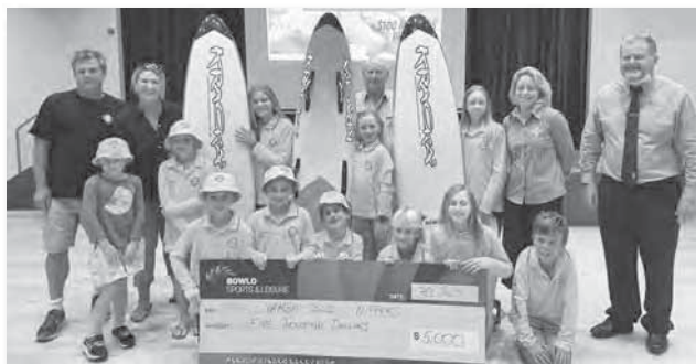
Yamba Bowling Club Presentation to Nippers