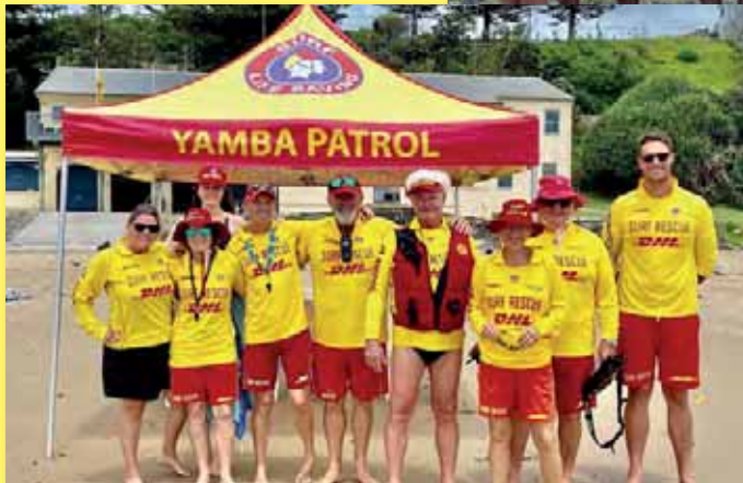
Christmas Day volunteer patrol members